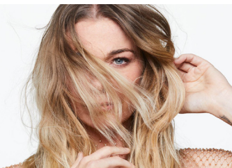
LeAnn Rimes June 10