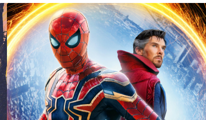
Free Movie Night - Spiderman: No Way Home (in partnership with the Maine Outdoor Film Festival) July 4