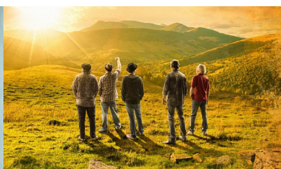
Snow Pond On Tap September 17